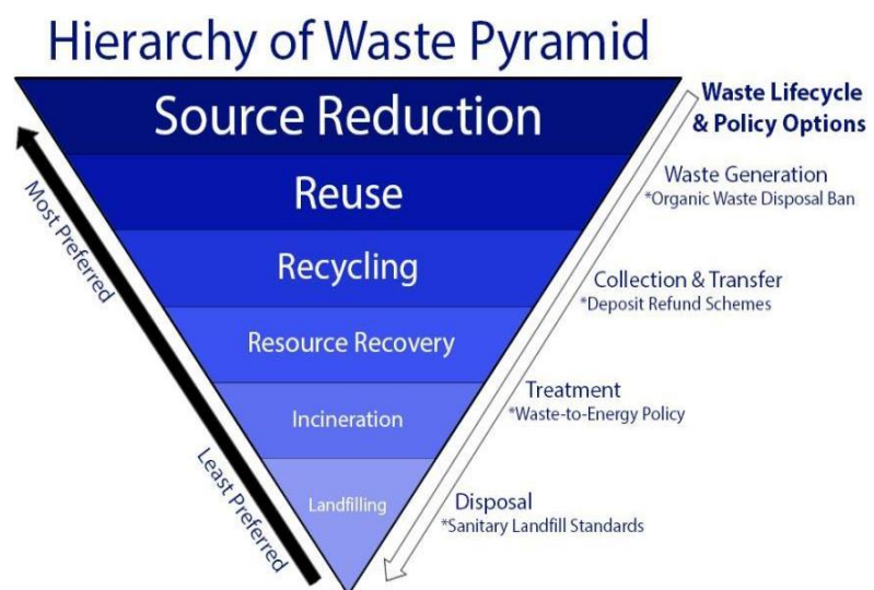
Box 1 Waste hierarchy as envisioned by the EU Waste Framework Directive 22

The second argument that is used to promote incineration, is that this method could reduce greenhouse gas emission, because incineration is less damaging than the landfill method 17 . In Albania, there are over 300 non-compliant and uncontrolled landfills 18 , known for their high potential of releasing methane and contaminating with chemicals the ground water, surface water, and soil. Indeed, compared to the landfill method, 19 incineration is a better option. However, at present there are many other underused alternatives for waste management in Albania that are less damaging to the environment, including waste minimisation, recycling, and repeated use of products (re-use) 20 . For this reason, the EU Waste Framework Directive insists on waste prevention rather than incineration or disposal (see Box 1). The framework of the National Strategy on Waste Management (2010-2025) also stipulated that incineration is only an option when all other possibilities have been exhausted. However, in the case of the incineration plant in Tirana – and possibly the other plants – alternative treatments of urban waste have not been considered. The feasibility study of the Tirana plant does not address any other means of waste management. As such, it cannot conclude that the establishment of a waste incineration plant is the most stable approach and the best solution 21 .