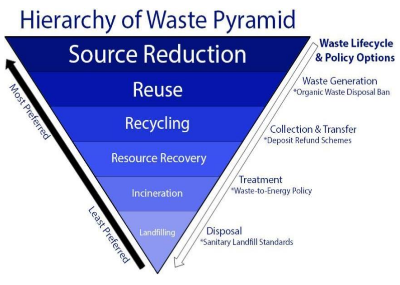
Box 1 Waste hierarchy as envisioned by the EU Waste Framework Directive<sup>22</sup>

also stipulated that incineration is only an option when all other possibilities have exhausted. However, in the case of the incineration plant in Tirana - and possibly the other plants alternative treatments of urban waste have not been considered. The feasibility study of the Tirana plant does not address any other means of waste management. As such, it cannot conclude that the establishment of a waste incineration plant is the most stable approach and the best solution<sup>21</sup>.