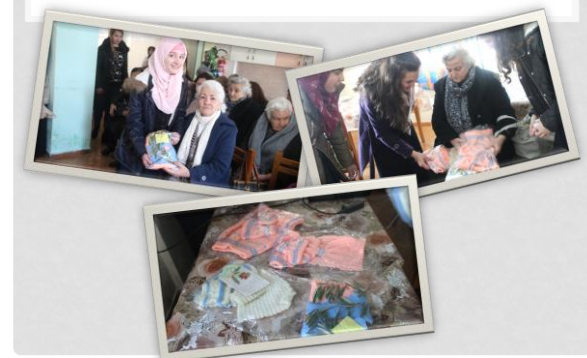
Students from “Mustafa Varoshi” Madrassa in Durrës contributing for the elderly

A complete version of the four parts of the presentation of the students from the “Mustafa Varoshi” Madrassa in Durrës is available at the following links: