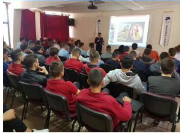
Students at “Vexhi Buharaja” Madrassa of Berat presenting their work