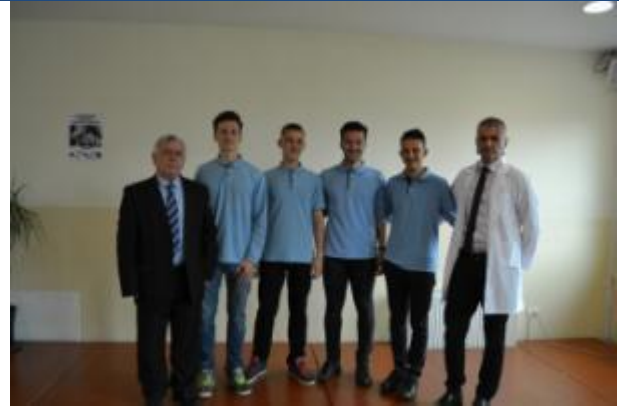
Students of the “Liria” Madrassa of Elbasan during their presentation