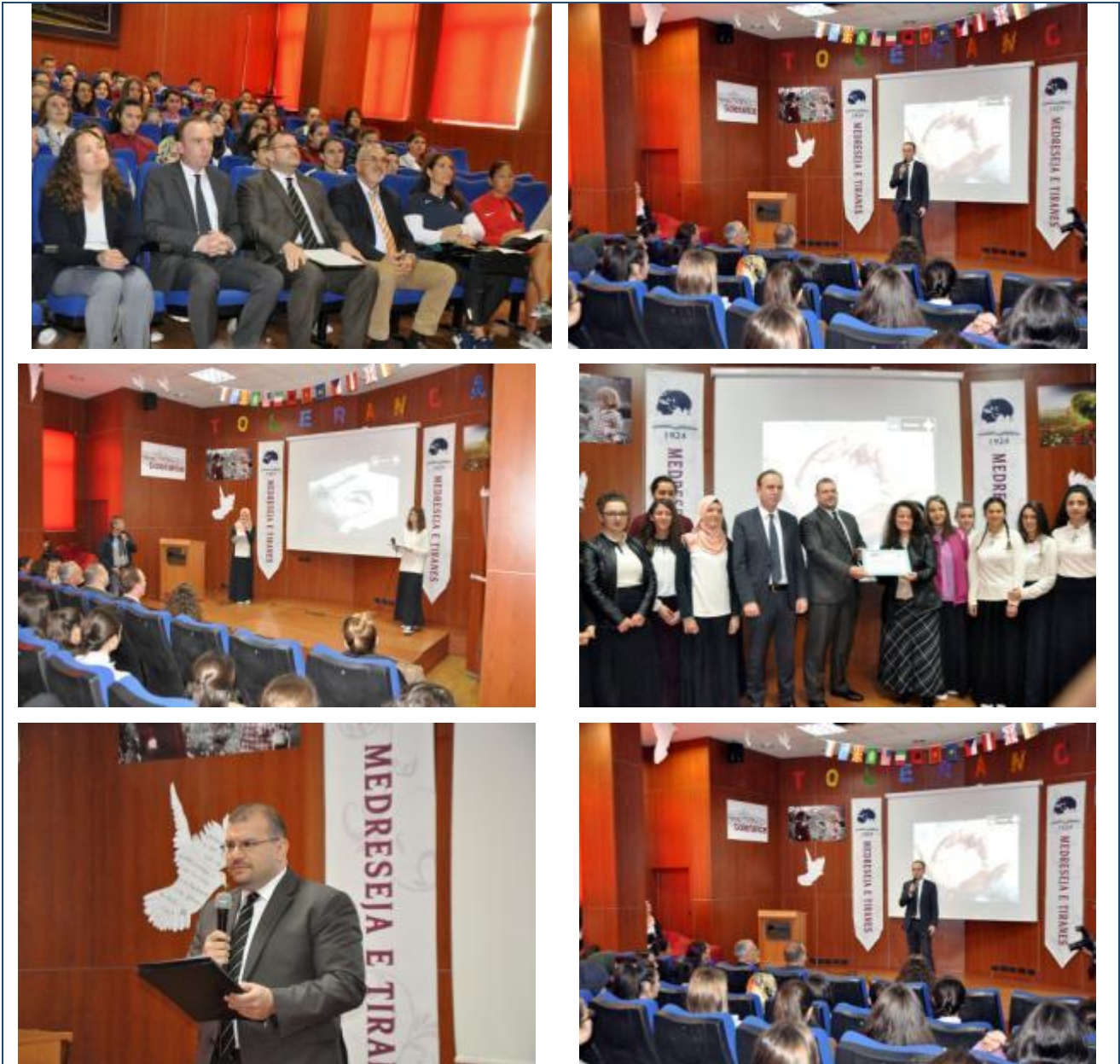
Presentation of students from the Madrasa of Tirana

The students of the “Protagonisti” high school of the Albanian Orthodox Community in Tirana made their portfolio presentation of their project “ Exploiting child labor is a crime ” in front of their peers, teachers, parents and representatives of the orthodox community. They brought rich information and data supporting their claim that this is a serious problem in Albania and looked closely at relevant legislation and public authorities and structures authorized by law to address this issue. They underlined the serious damage that this phenomenon has on the personality, character, physical and mental health of the children subject to work at a very early age. The same problem was also addressed by the students in the “Hafiz Ali Korça” Madrasa of Kavaja who considered the problem as a threat to society and underlined the importance of solidarity and active support to abused children especially during religious holidays.