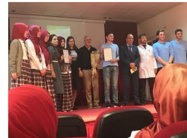
Presentations from the boys and girls in the medresse of Shkodra