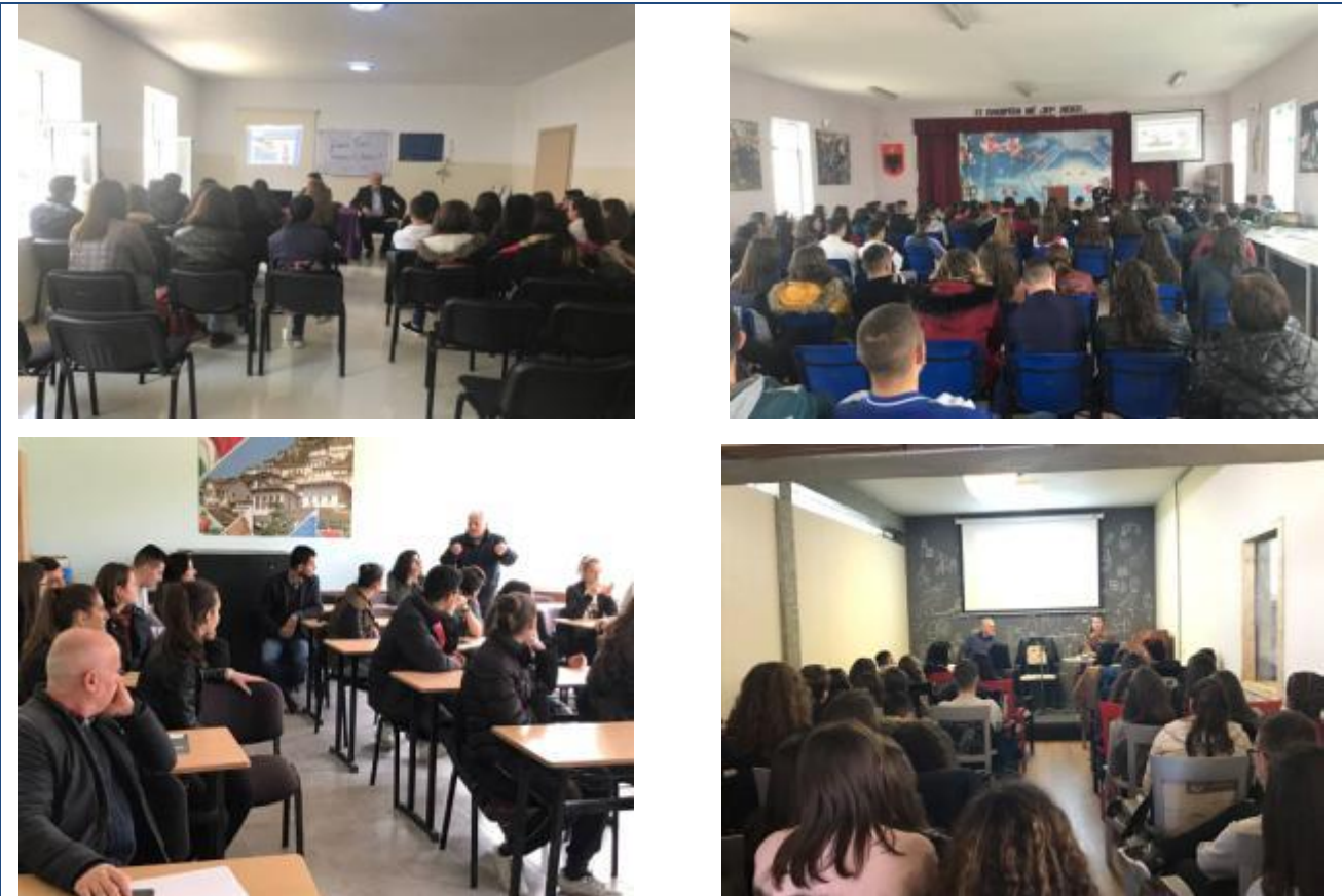
Photos from briefing sessions

The Project Citizen against Corruption Brochure , firstly published in 2015, constitutes the main reference for the in-class training of the students on the corruption phenomena, its definition, causes, types and forms of corruption, its impact on economy, state governance as well as social and political life of the country and how it is measured. It also describes the existing legal and institutional setting on anti-corruption in Albania based on the instrument of National Integrity System developed by Transparency International. Additionally, it is designed to promote youth involvement in concrete activities against corruption in their community.