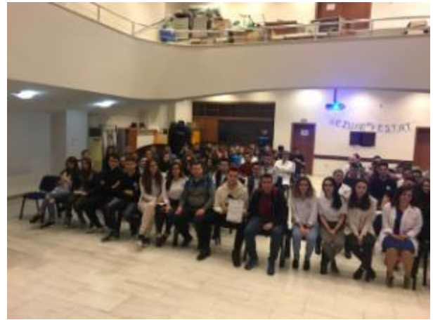
Presentation from students of "Protagonisti"

The students of grades 11 in “Liria” Madrassa in Elbasan addressed the problem of corruption in Albania in their project "No corruption – The future of Albania" . They explained why they chose to work with this problem and provided interesting data about corruption in our country and analyzed the reasons for the widespread of corruption in our society. They came up with three concrete proposals to help fight corruption: Increased awareness among citizens in the community about the harms of corruption; movement for civic education against corruption and using the web page of their school for these two proposals. The students prepared leaflets and organized awareness campaigns in their community and other schools in the city of Elbasan. A complete version of their project is available at https://prezi.com/ozkvab0w80f9/pa-korrupsioni/